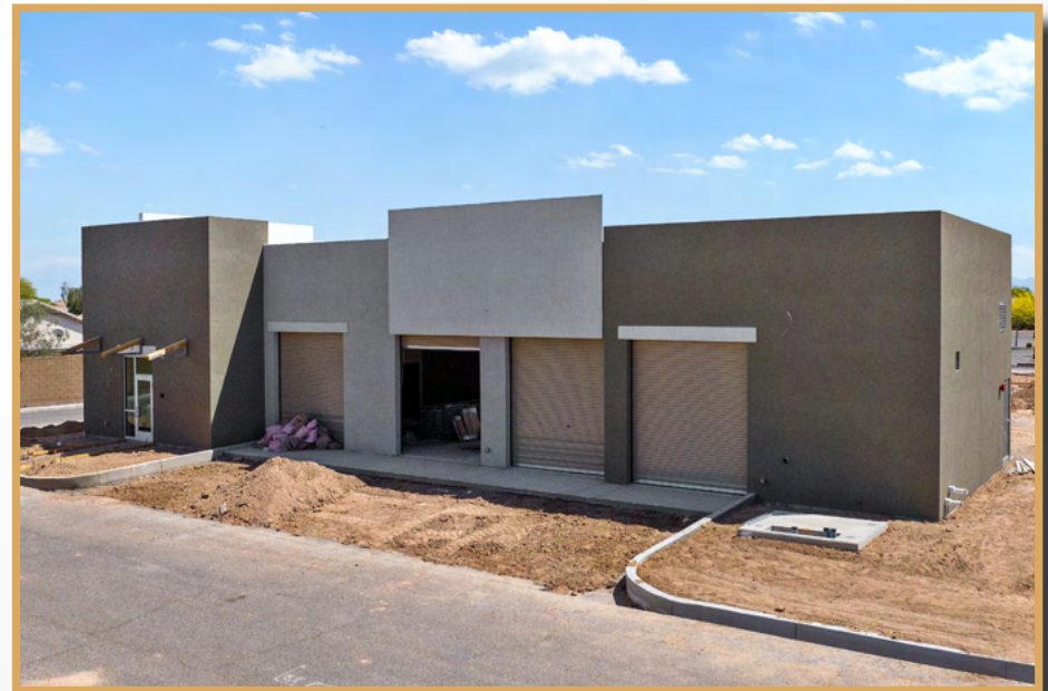
Construction Status as of April 2024