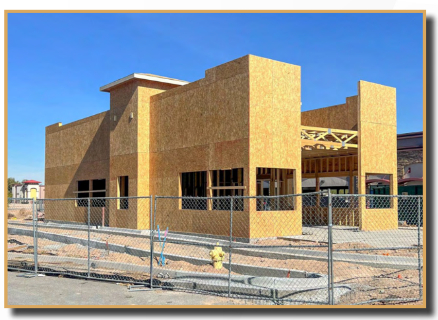
Construction Status as of February 2024